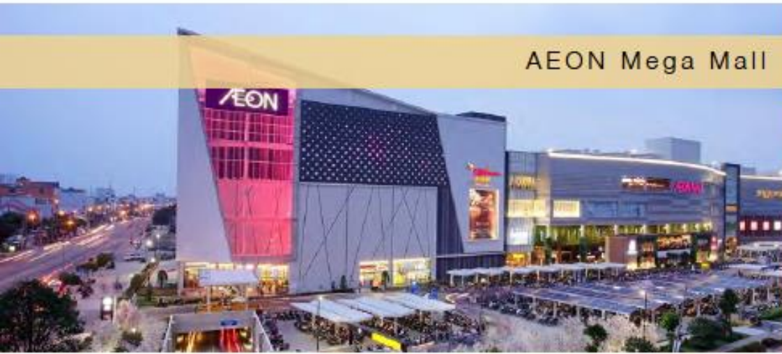
AEON Mega Mall