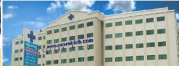
Sen Sok International University Hospital