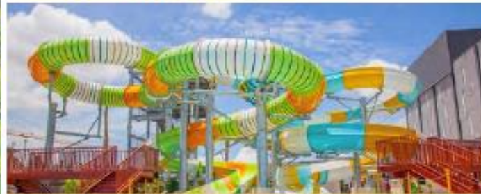
Water Garden Theme Park