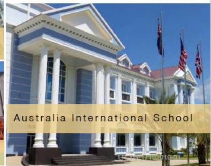
Australia International School