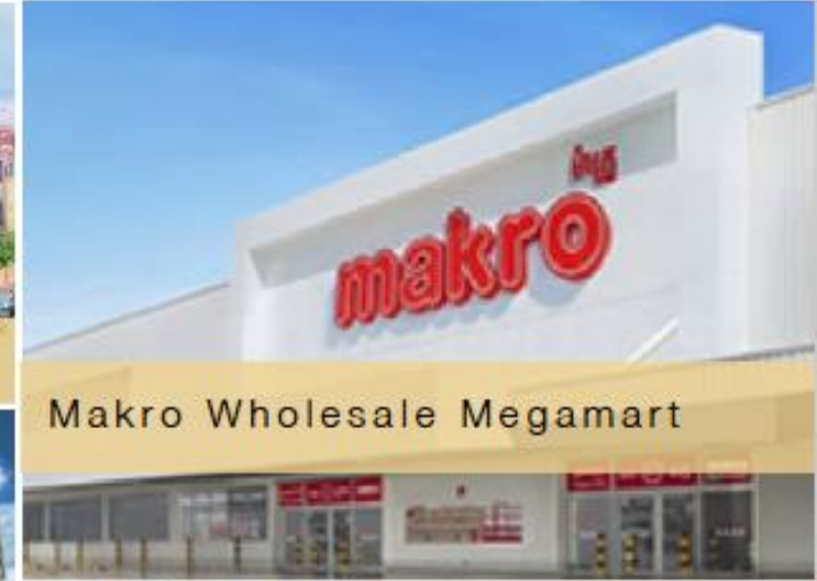
Makro Wholesale Megamart