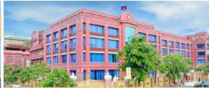
National Bank of Cambodia