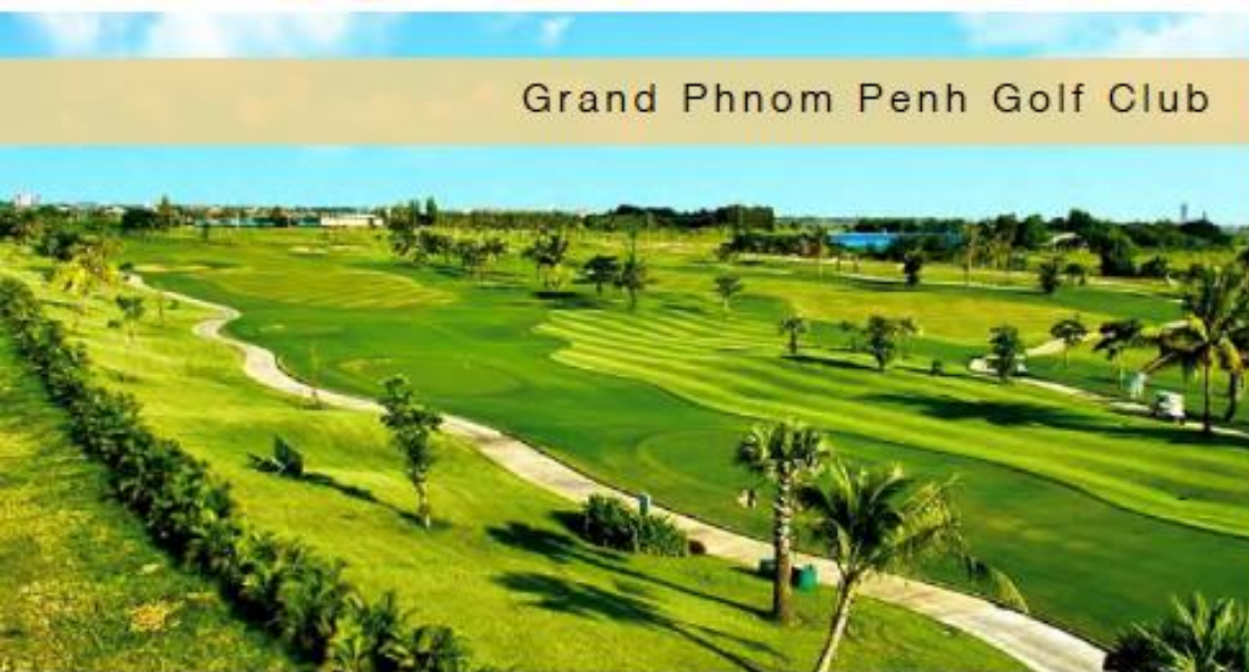
Grand Phnom Penh Golf Club